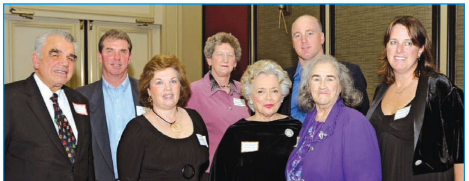
Good Shepherd Alliance Board Members, staff and supporters were thrilled to receive the Non-Profit Care Provider Project of the Year Award for the Center of Hope project. Through reduced costs and donations of time, money and materials by Toll Brothers and more than 75 supplier partners, GSA saved over $400,000 in construction expenditures working with HomeAid.