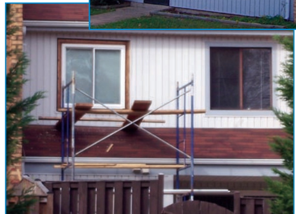
HomeAid Builder Captain SugarOak Corporation made two townhouses more energy efficient by replacing single-pane windows and doors. The renovations also upgrade the homes' exteriors.