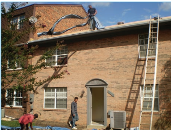
John Darvish Construction employees work on the roofs of two townhouses for Good Shepherd Housing & Family Services.