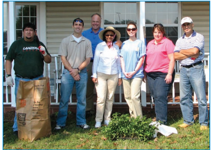
M&T Bank employees spent six hours working at Max's Place.